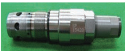
Part No. KRD21EK10-350/315/140-T