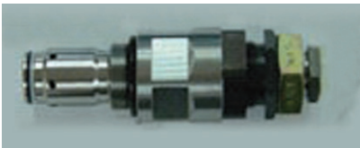
Part No. 723-40-51102