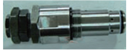
Part No. 709-70-51401