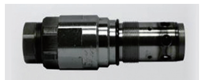
Part No. V9612039829