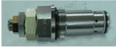
Part No. 709-70-51200