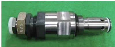
Part No. 723-40-51401