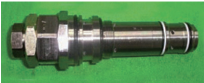
Part No. 723-40-50100