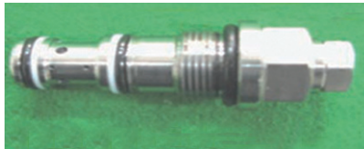
Part No. 723-40-56100