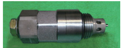
Part No. 21113-40051