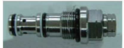
Part No. 723-40-56302